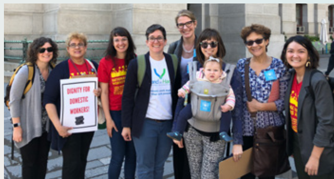
Philadelphia members and workers supporting local Domestic Workers Bill of Rights, 2019.

Contact us at justandcaringfuture@domesticemployers.org to make a plan.