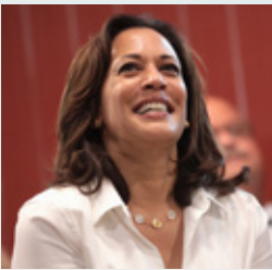
VICE-PRESIDENT KAMALA HARRIS AT THE CARE CAN'T WAIT SUMMIT

“ [Infrastructure] is not only about roads and bridges... it's about care. ...We want to create an economy in which care is readily available for all those who need it. We want to ensure that caregivers are treated with dignity and respect.”