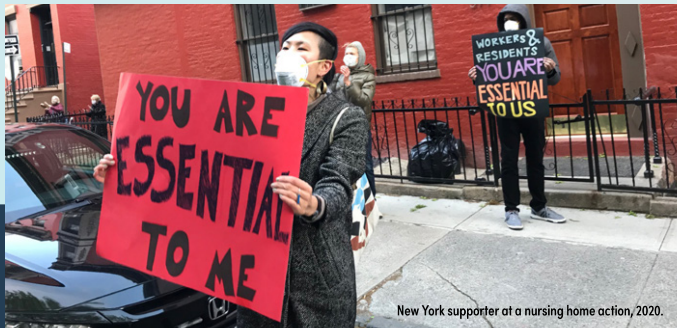
New York supporter at a nursing home action, 2020.