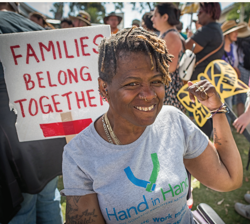
▼ Image description: Black woman with a Families Belong Together sign (2018).